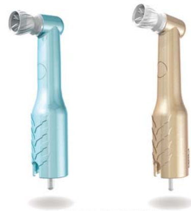
ACTUAL SIZE SHOWN